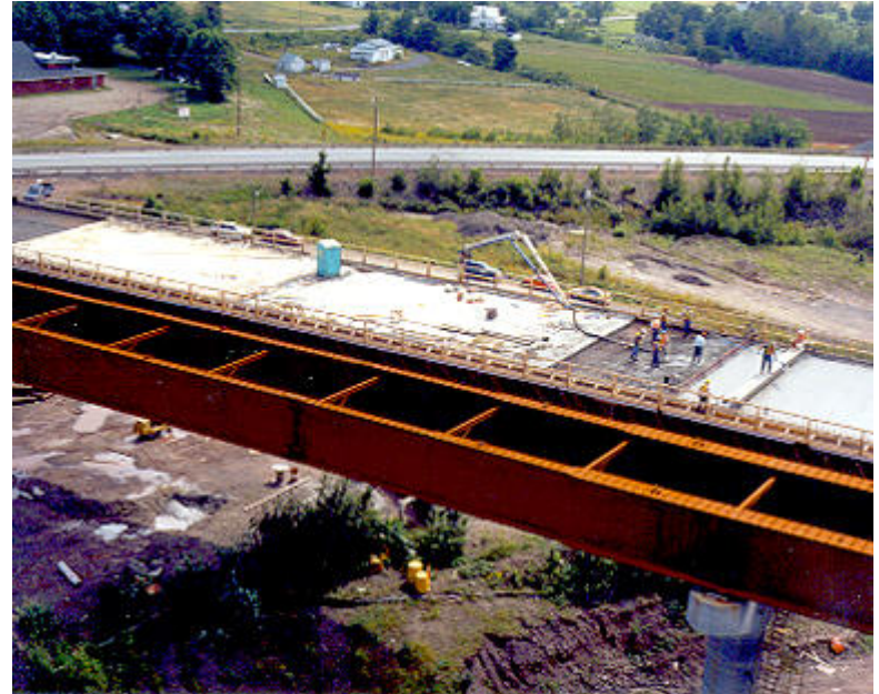
Jemseg River Bridge construction, Fredericton-Moncton Highway, NB, Canada